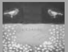
Cynthis Innis BA '91 "Snow and Sand" 1999 oil on canvas 18" x 22"

Fill out the form below (with a tax deductible donation, if you can!) and help update our directory!